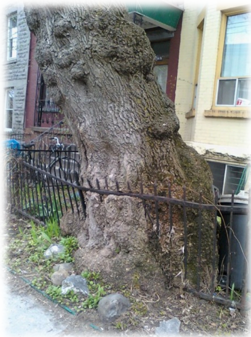
A picture my daughter took in Montreal on a city side street. That’s an iron fence. It looks like there would be some seriously good figure in there, but probably pretty hard to get to!