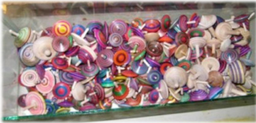
Tops turned so far for the Spruce Meadows event.